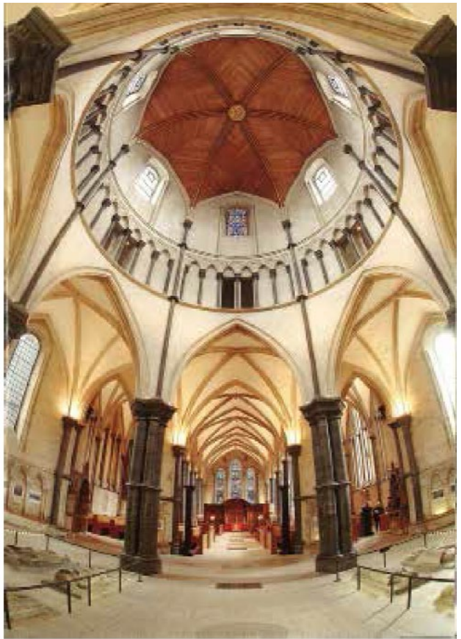
Temple Church, London Venue for Henry V

High-resolution images for download: www.anticdisposition.co.uk/images.html