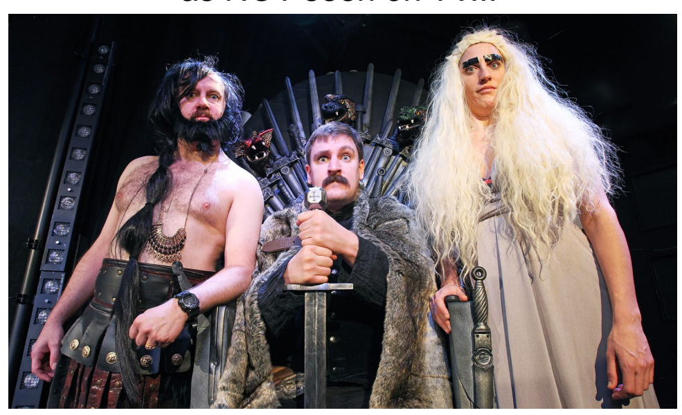
"A must for any GOT fan" Time Out

After a sold-out, critically acclaimed West End season, Graeme of Thrones is setting out on a 35-date UK tour from Friday 22 April - Thursday 16 June.