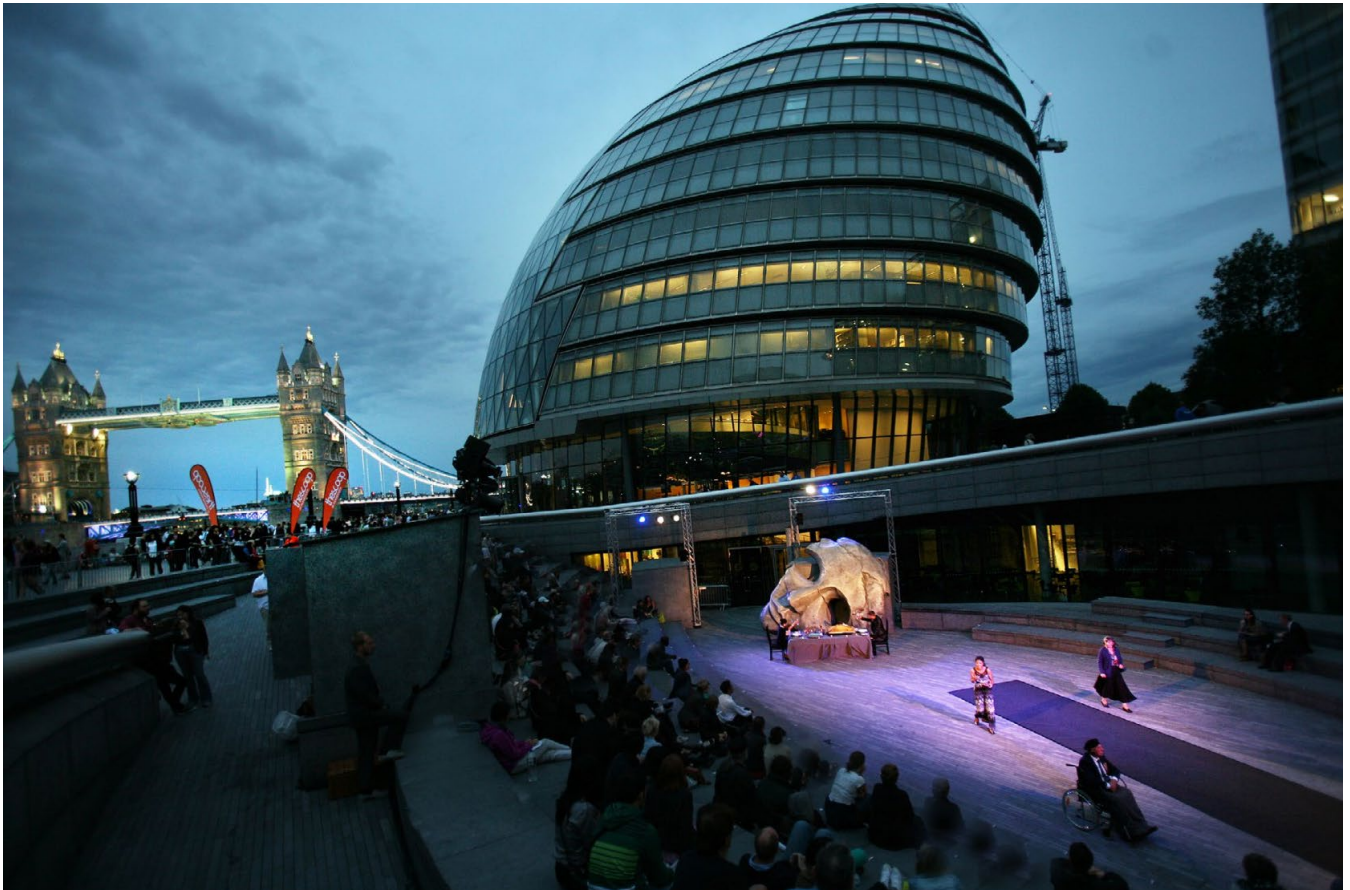
Picture of a previous season at The Scoop