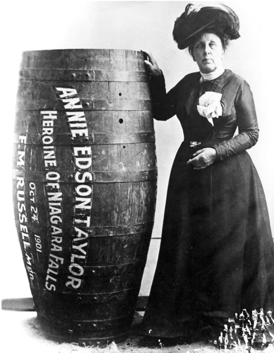
Anna Edson Taylor

Queen of the Mist explores the fickle world of celebrity and sensationalism with an unconventional heroine determined not to live an ordinary life. With a soaring score that incorporates turn-of-the-century themes with LaChiusa's insightful and engaging style, this award-winning musical is the story of how one woman risked death so that she could live.