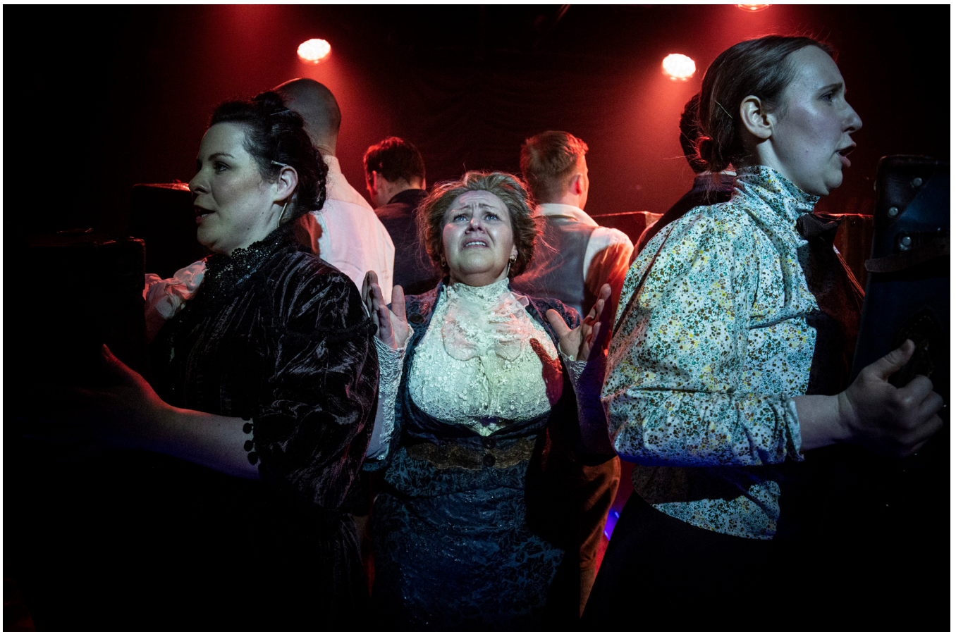
The cast of 'Queen of the Mist'

Pint of Wine Theatre Company is an innovative theatre company providing opportunities for artists, technicians and practitioners to challenge the conventions on how theatre should be presented. They aim to challenge the conventions of how theatre should be presented and look to be disruptive in what is understood of, and expected from, the London fringe theatre scene.